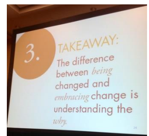
Slide from “Selling Change Across Your Organization”