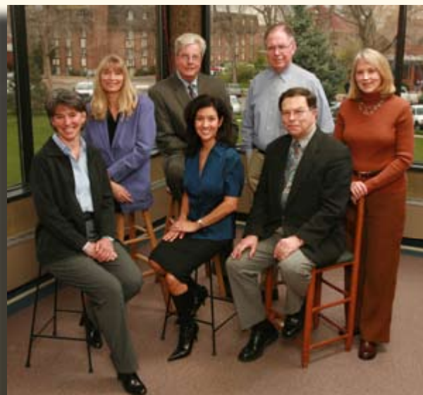
Poudre River Public Library District Board of Trustees (left to right beginning with front)