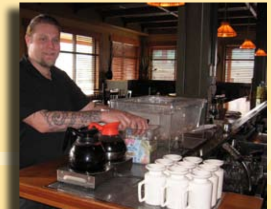
Austin's Grill on Harmony has hosted SE Storytime since 2004