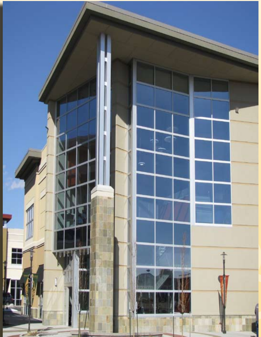
Council Tree Library