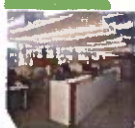
Improving Indoor Air Quality