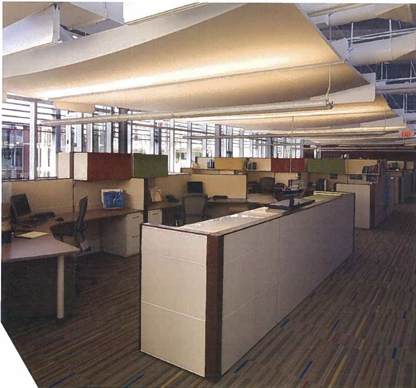
International Fund for Animal Welfare, Yarmouth Port, Mass. (LEED – NC Gold Certified)

Milliken innovations advance green building with creative design aesthetics and attributes to support healthy interiors.