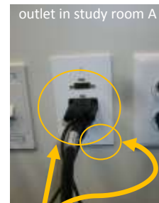
VGA cable with audio

7. Double click the Smart Notebook icon on the desktop.