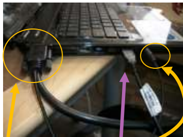
VGA cable with audio