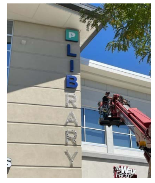
New exterior sign installation at Council Tree